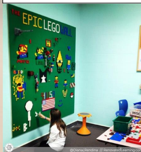
4. DIY maker/LEGO/art/poetry wall