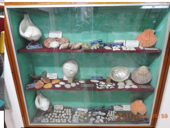
8. Reclaimed glass case upcycled into a mini museum!