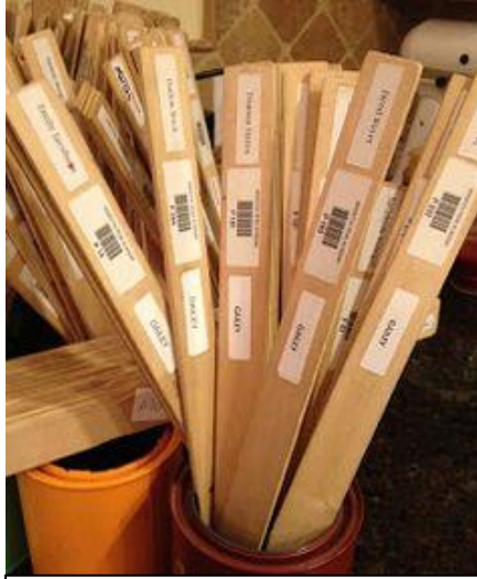
9. Upcycled kid-friendly check-out and book handling systems