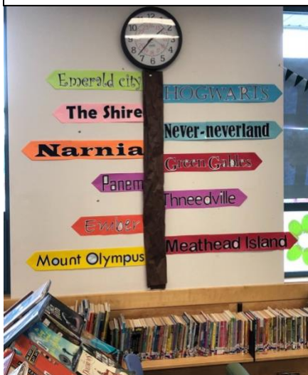
1. DIY book-related displays