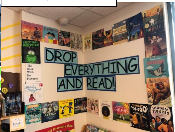
2. Use dust jackets as décor