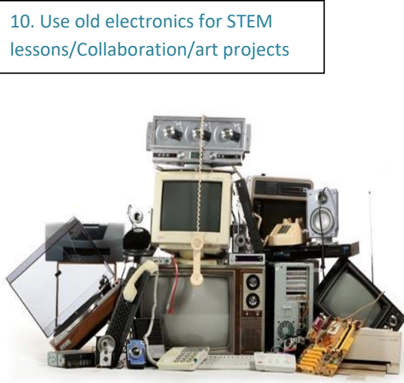
10. Use old electronics for STEM lessons/Collaboration/art projects