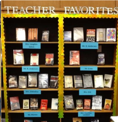
6. Simple displays to connect students and teachers