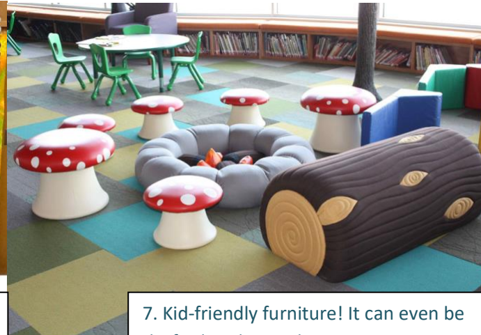
7. Kid-friendly furniture! It can even be thrifted or donated.